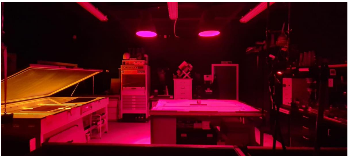
Panoramic view of the analog laboratory inside La Tercera Nave . An exciting room with all kinds of machinery. On the left, with orange light, a LED exposure unit. In front, with drawers, an arc exposure unit.