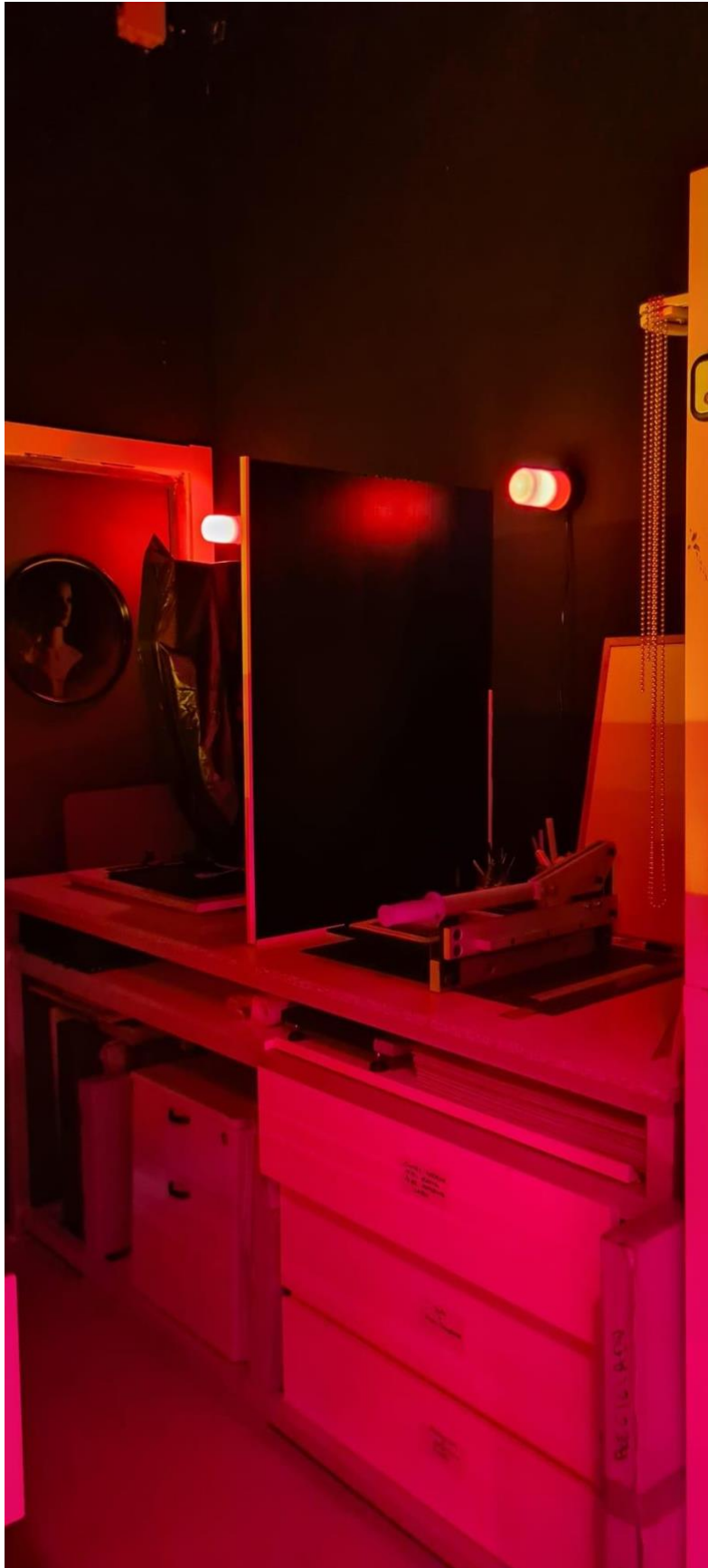
Detail of the photographic enlargers available for rent.