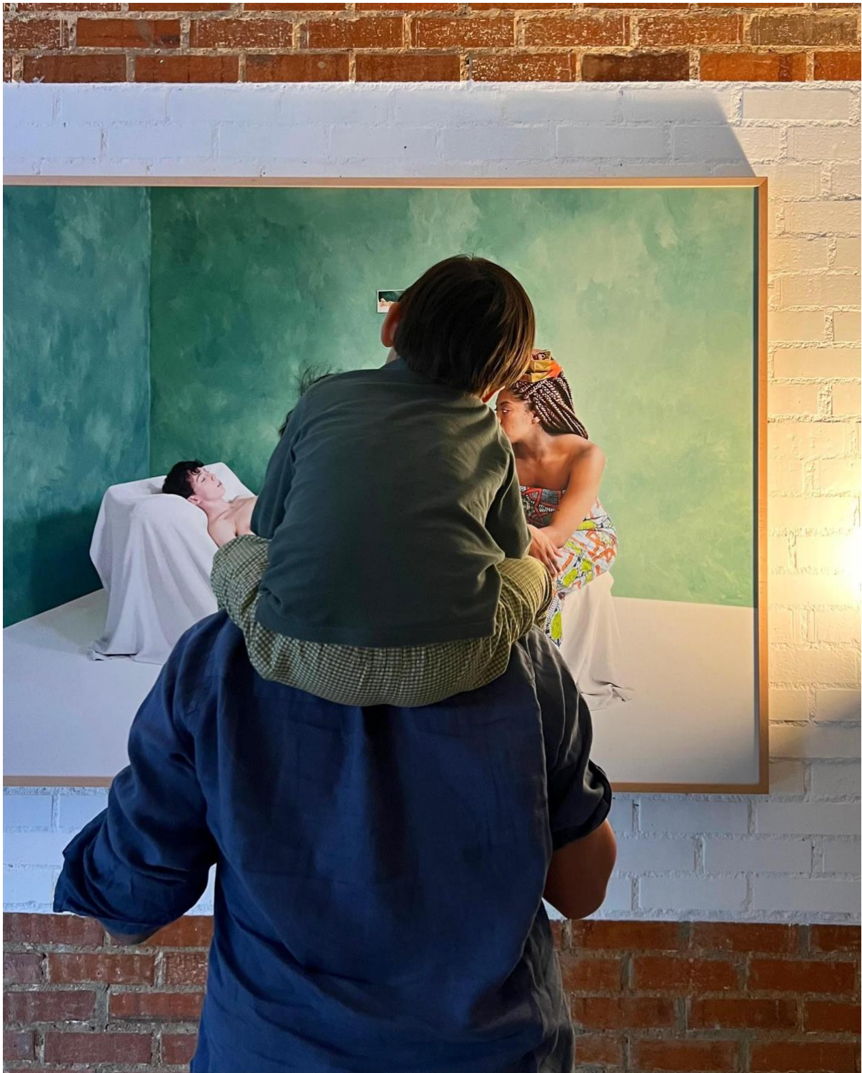
Art for all audiences. One of our youngest visitors, captivated by one of the photographic works by Gloria Oyarzabal that was chosen for the Enaire 2024 exhibition. "Usos Fructus Abusus, La Blanche Et la Noire" presents a profound anthropological reflection where the individual and collective memory come into conflict. A visual journey that even the little ones can delve into and that challenges our perception of history and identity.