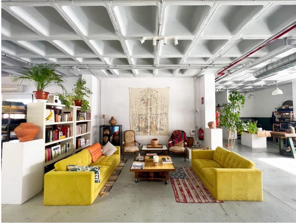
Lounge area of La Tercera Nave .

A meeting place for artists and a photocall for visitors.