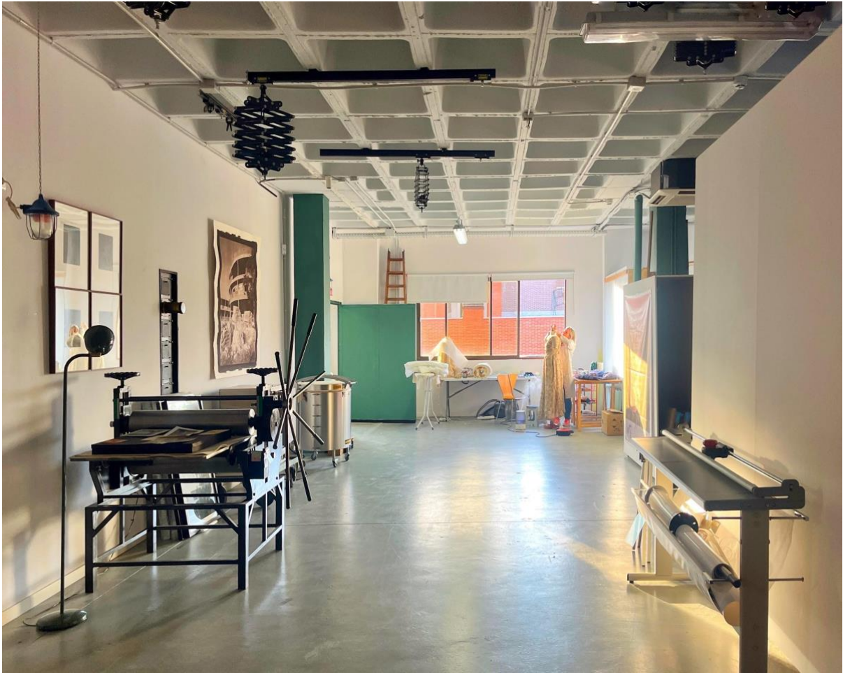
La Tercera Nave includes multiple disciplines. Among them, and in the image, one of the restoration teams is meticulously working on a textile piece.