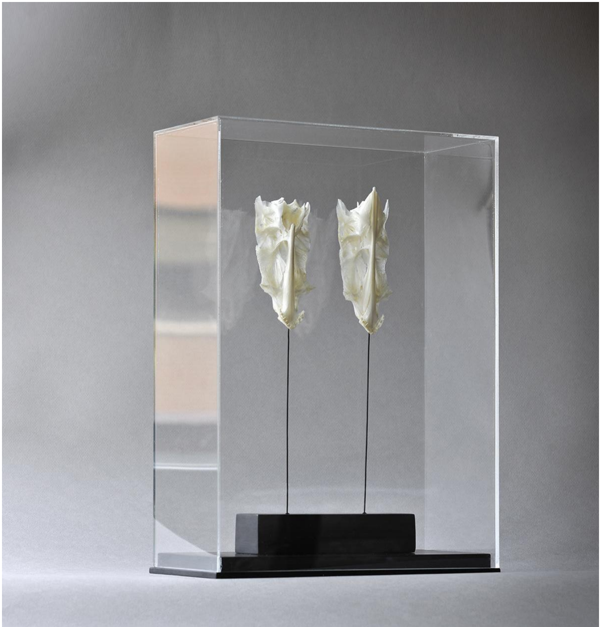
Detail of the work by artist Pia Post, belonging to her series "Esencias óseas." As the artist herself explains, "My artwork is a tribute to the supreme artist of all: our mother, nature. The perfection of creation continues to fill me with as much wonder as ever, and I never tire of contemplating the limitless beauty manifested in countless forms, colors, and figures."